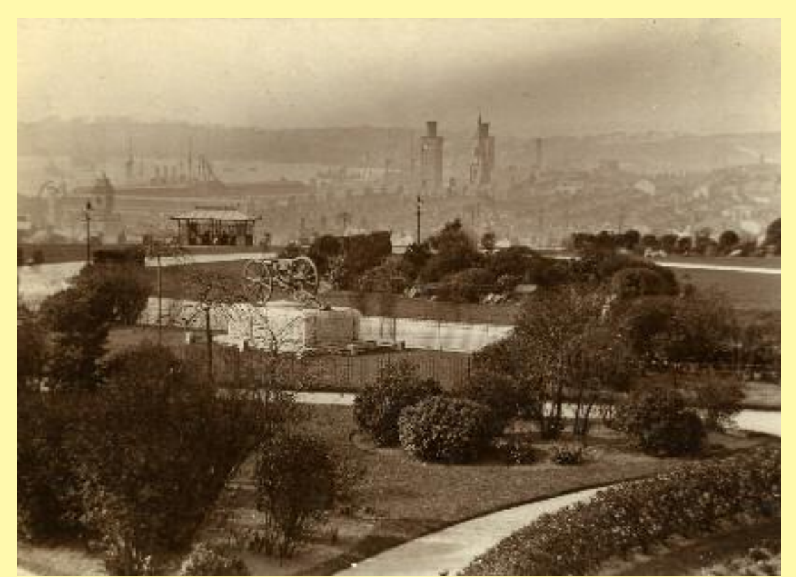
Park and view to the north-west, c.1905 Plymouth City Museum & Art Gallery

To complete the Trail, follow the old military road, now Raglan Road and Madden Road, past the Gatehouse to Raglan Barracks, built in the 1850s. On descending Devonport Hill - the Napoleonic Guardhouse of 1811, the drawbridge cutting and Bluff Battery, built 1779-80 to guard Stonehouse Bridge, are further reminders of Devonport's historic defences.