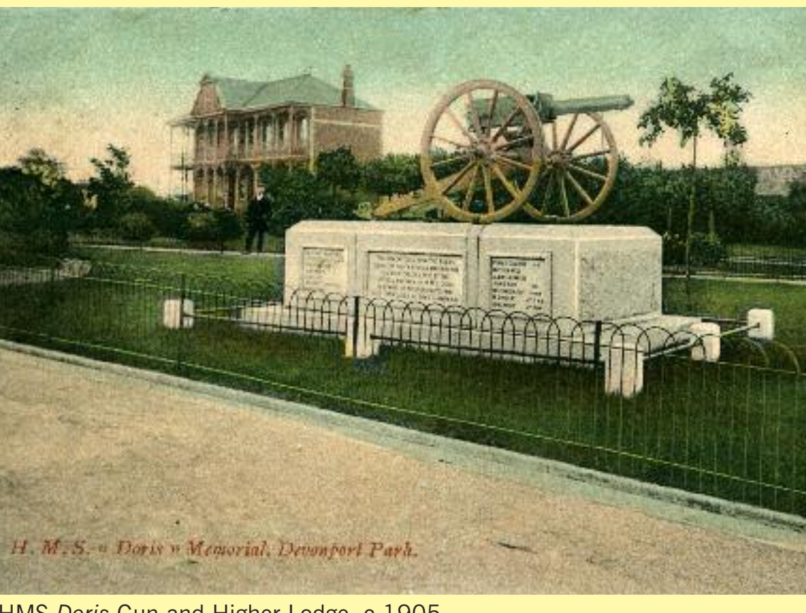
HMS Doris Gun and Higher Lodge, c.1905