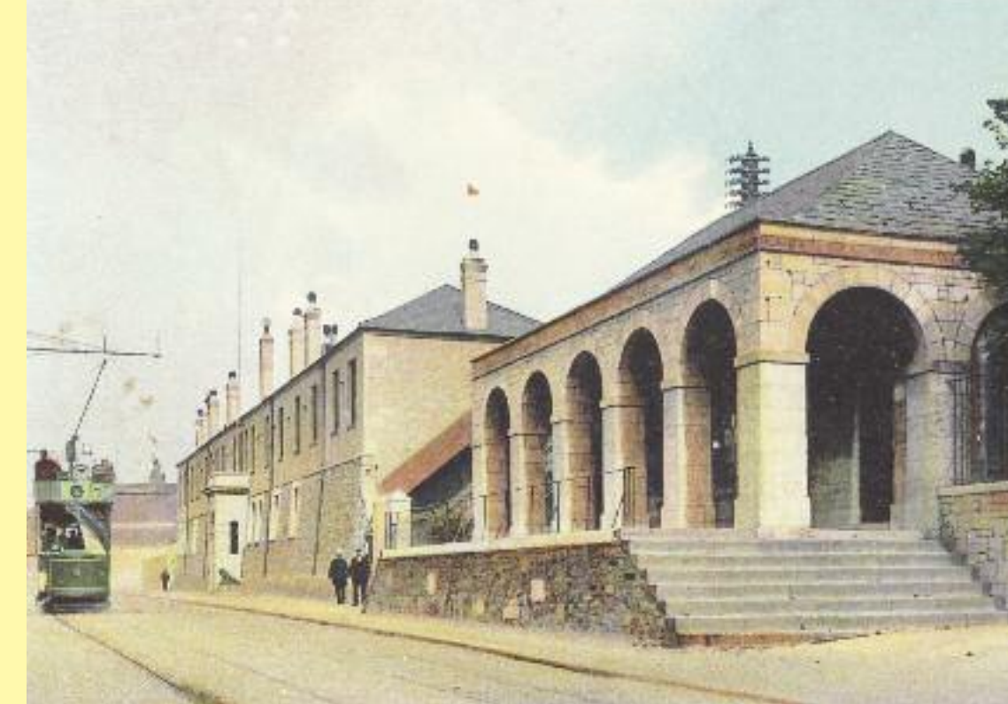
Guard House and Cumberland Block, Devonport Hill, c.1905 Private Collection